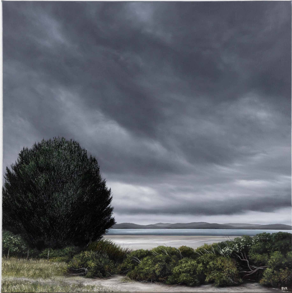
Brooke van Ruiswyk Inlet Pine at Low Tide 2026 oil on canvas 76 x 76 cm $3,950