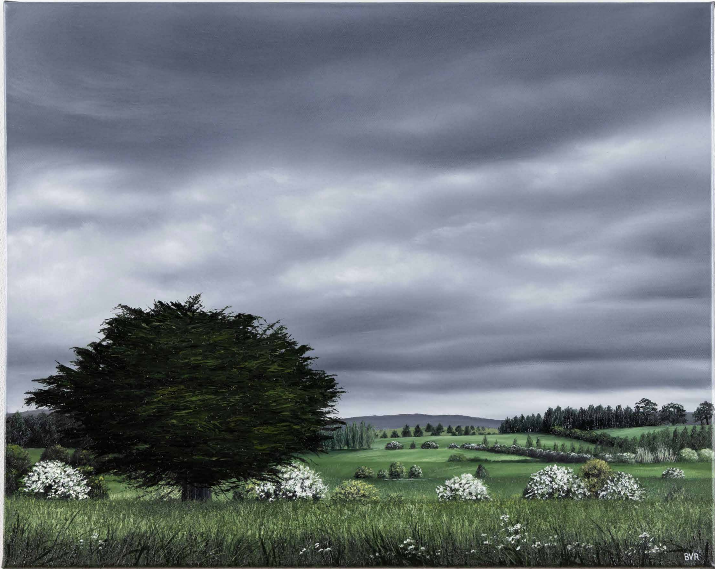
Brooke van Ruiswyk Early Spring Green 2026 oil on canvas 40.5 x 51 cm $2,200