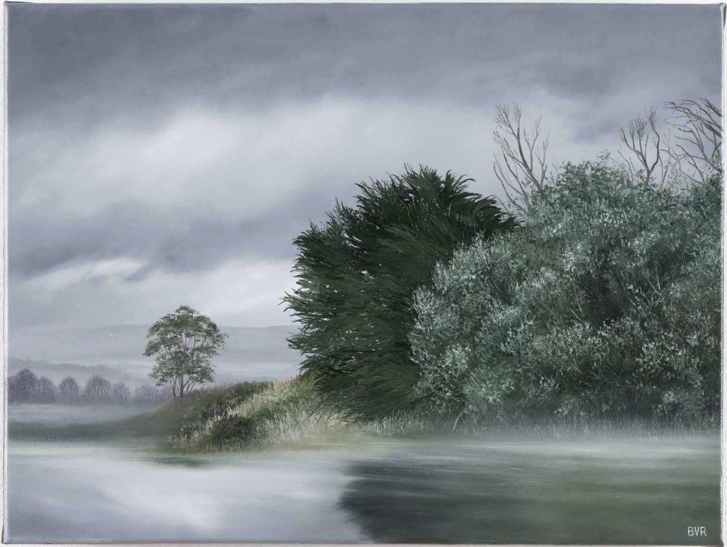
Brooke van Ruiswyk Misty Reflections 2026 oil on canvas 30.5 x 40.5 cm $1,850