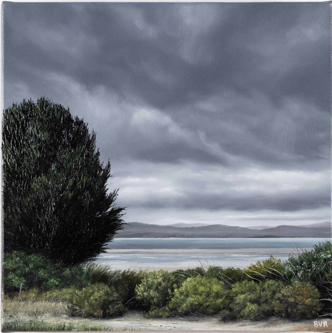
Brooke van Ruiswyk At Low Tide 2026 oil on canvas 30.5 x 30.5 cm $1,550