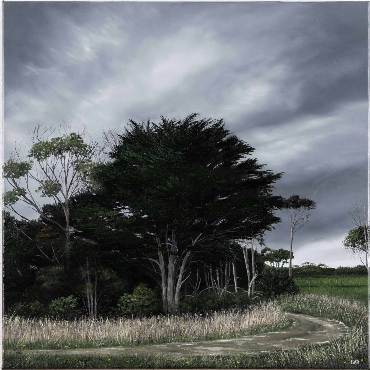
Brooke van Ruiswyk The Old Farm Road 2026 oil on canvas 51 x 51 cm $2,400