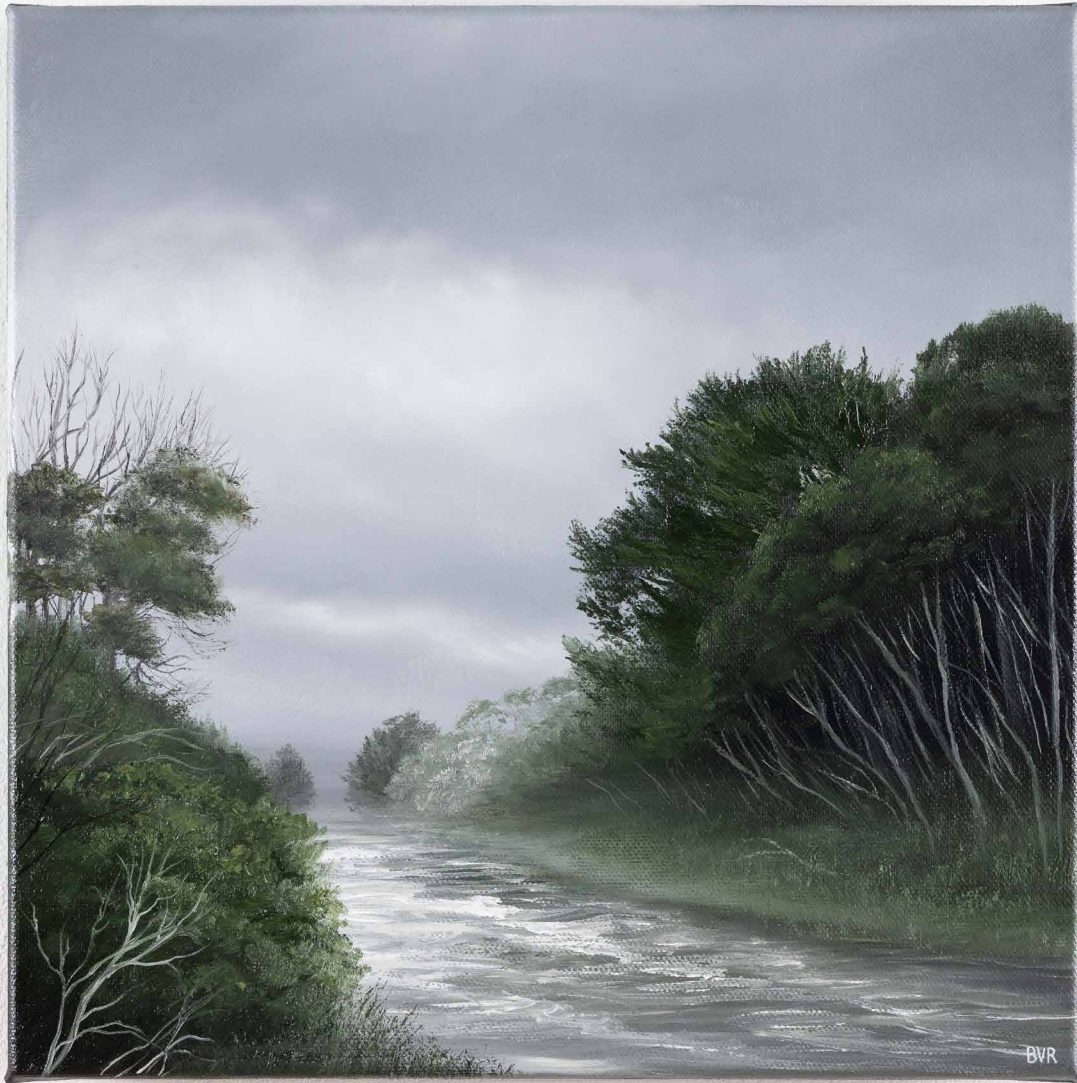
Brooke van Ruiswyk Where the River Runs 2026 oil on canvas 30.5 x 30.5 cm $1,550