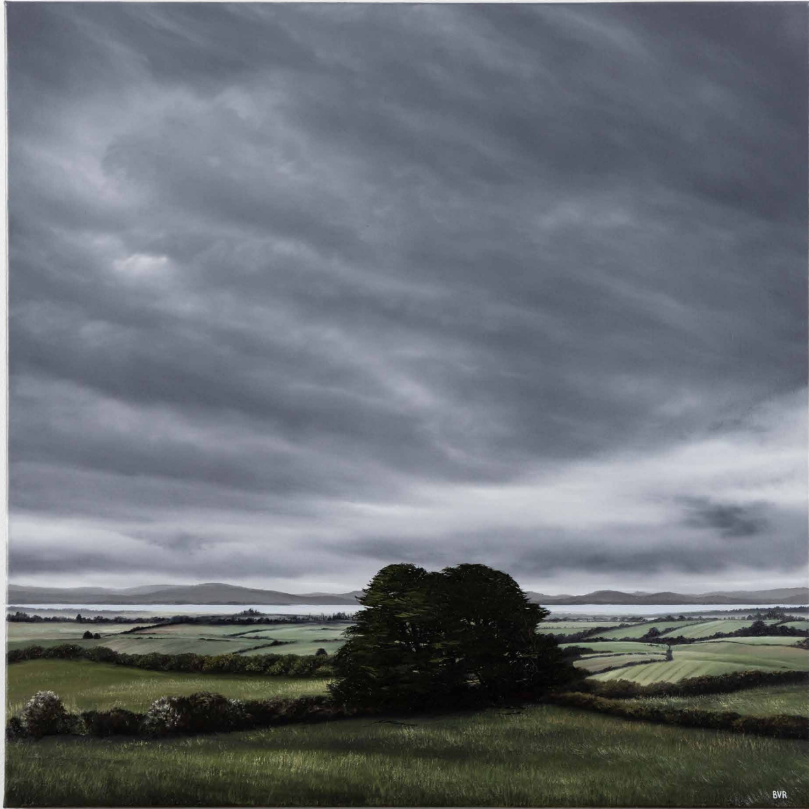
Brooke van Ruiswyk Together Always 2026 oil on canvas 76 × 76 cm $3,950