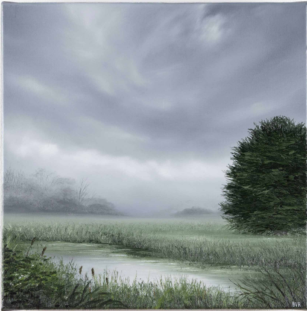
Brooke van Ruiswyk Misty Morning Stillness 2026 oil on canvas 30.5 × 30.5 cm $1,550