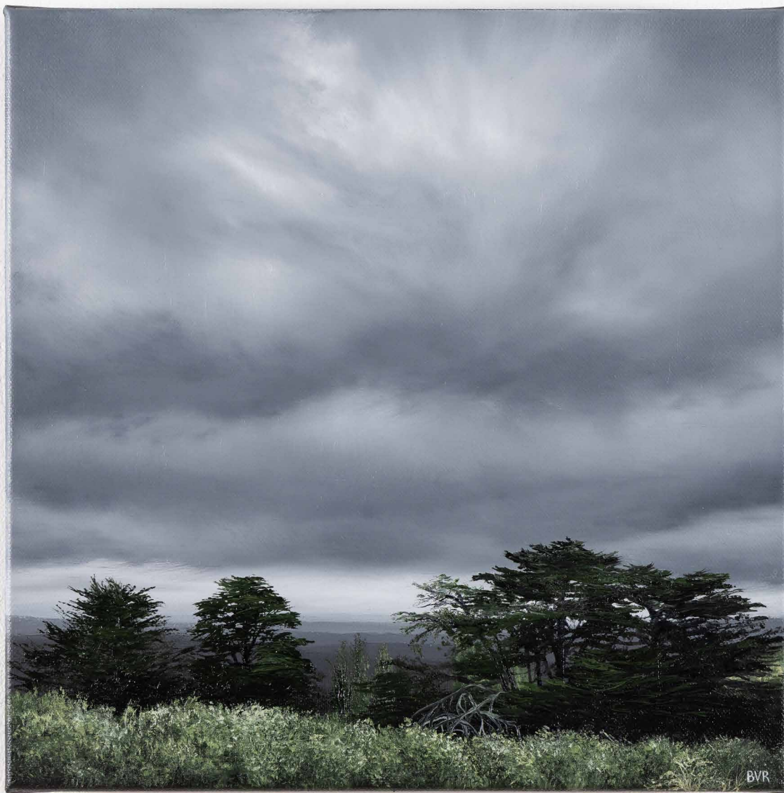
Brooke van Ruiswyk The Secret Valley 2026 oil on canvas 30.5 x 30.5 cm $1,550