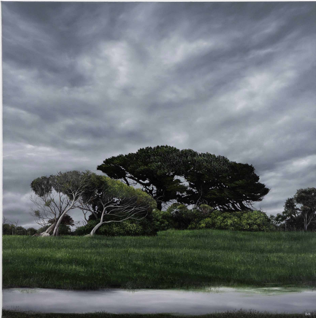
Brooke van Ruiswyk Drawn to You 2026 oil on canvas 92 × 92 cm $5,400