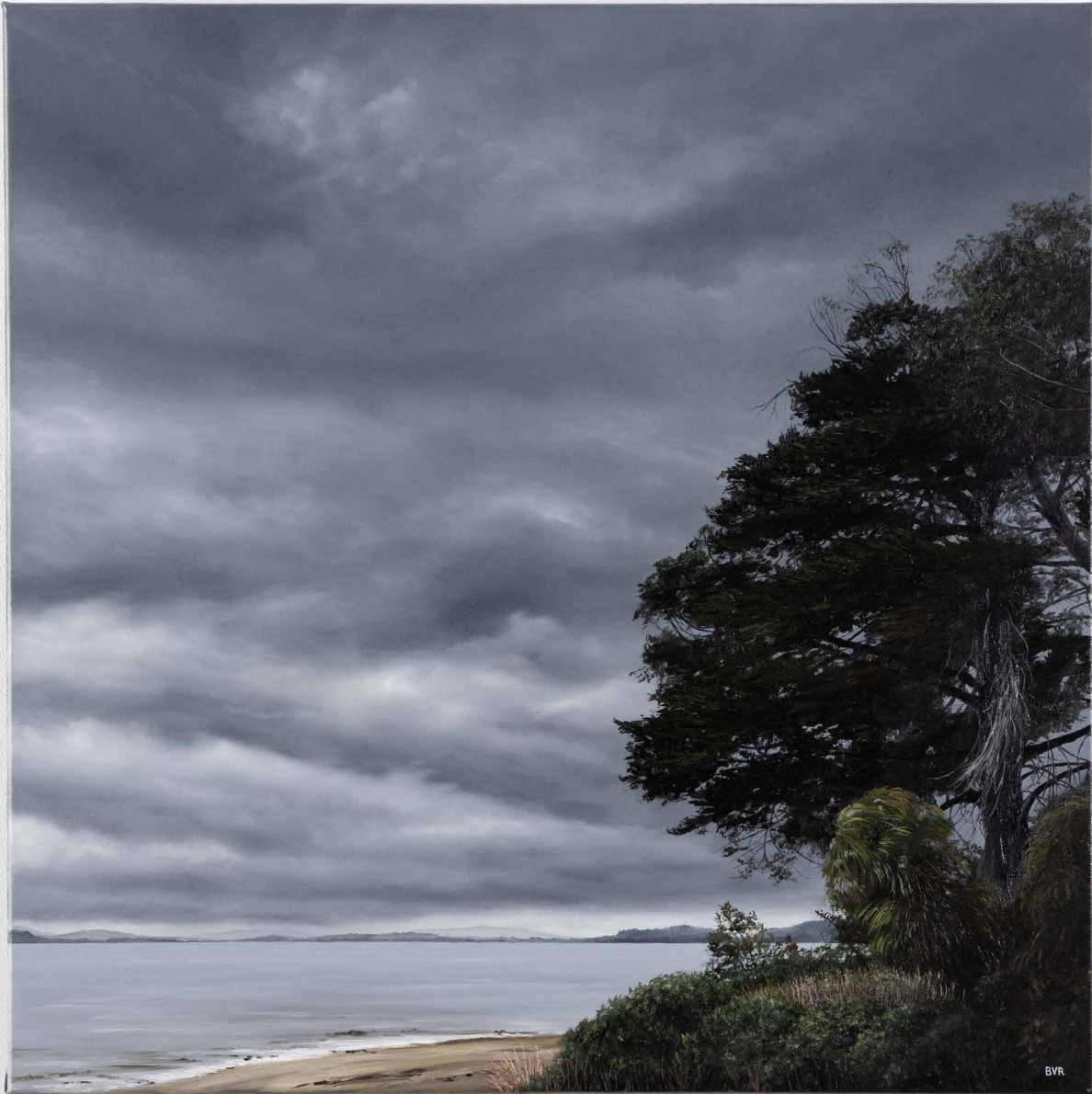
Brooke van Ruiswyk The Shoreline Pine 2026 oil on canvas 61 × 61 cm $3,200