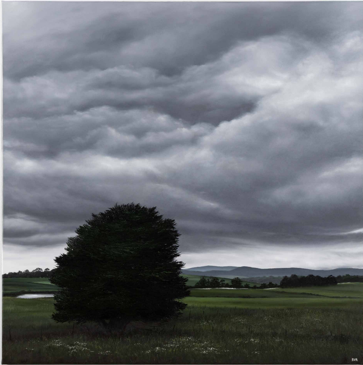
Brooke van Ruiswyk Gathering Clouds 2026 oil on canvas 92 × 92 cm $5,400