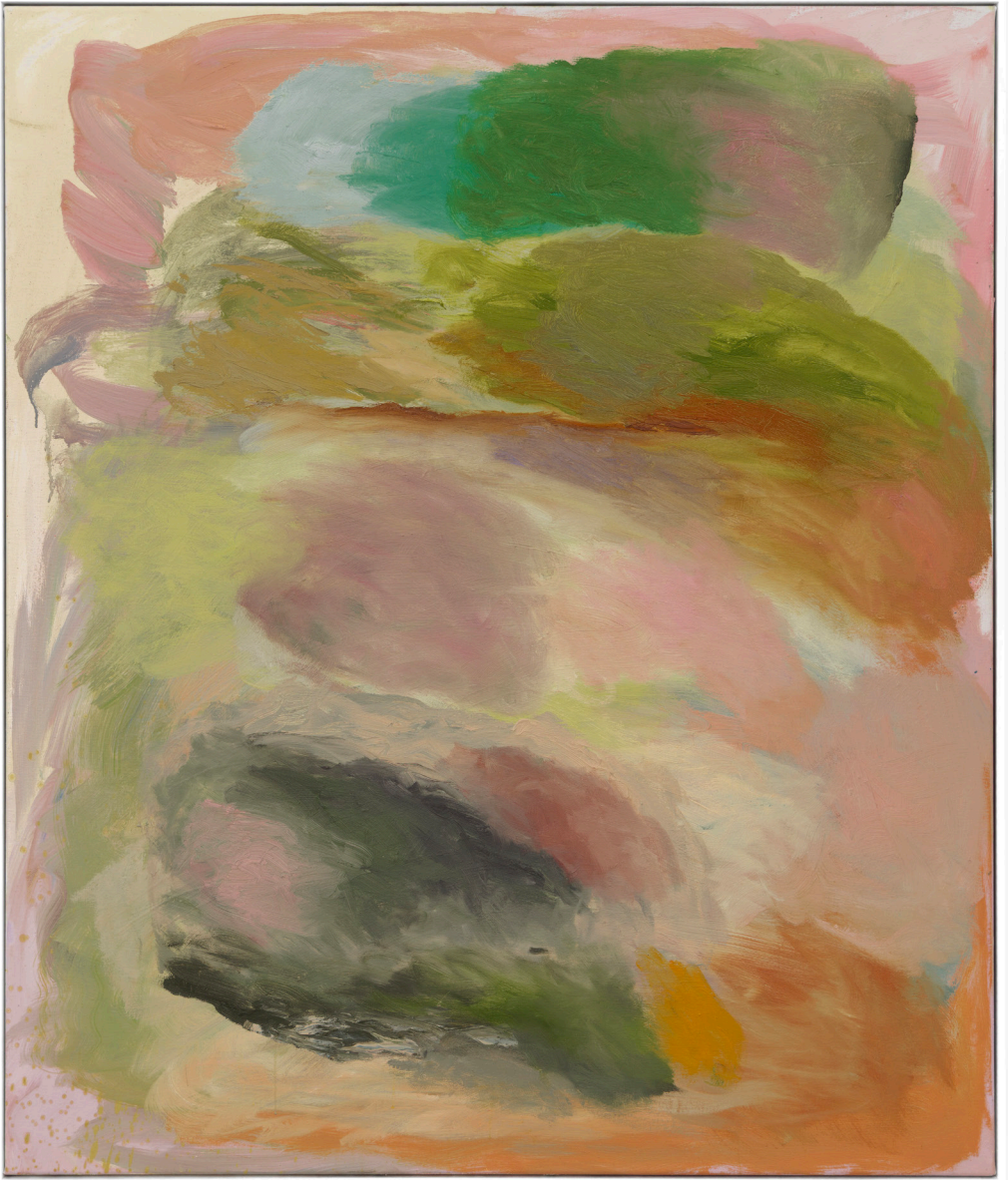
Dirty Work IV, 2026 133.5 × 113 cm Oil, wax and oil stick on canvas Framed in White Tasmanian oak $7,200