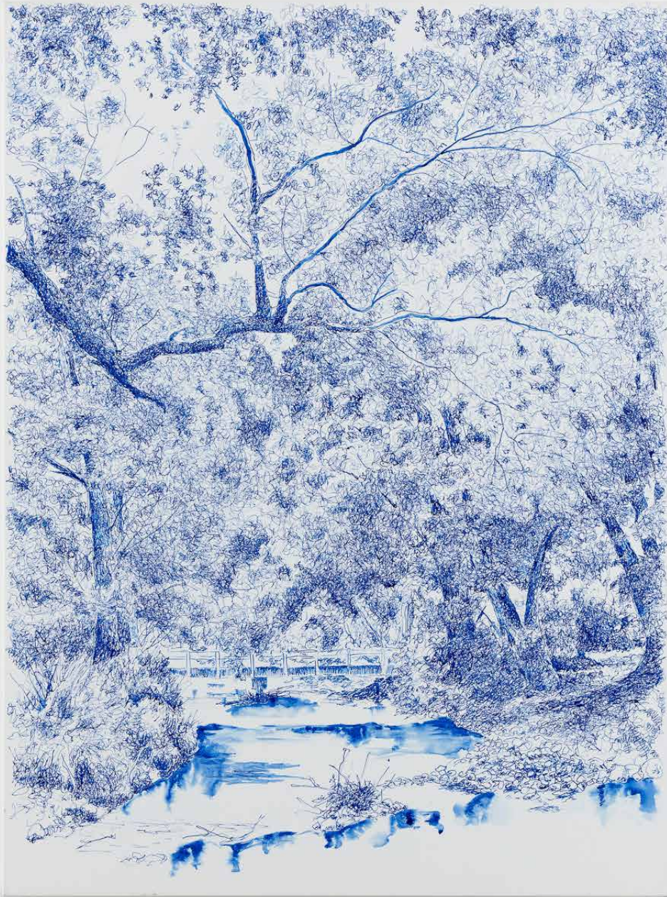
Drew Truslove Minnamurra River - After the Flood - Eighth Angle archival ink on canvas 120 x 90 cm $3,600