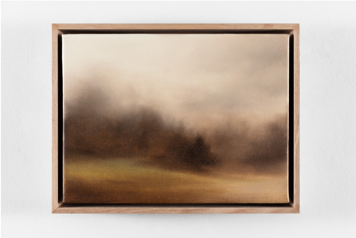
Where old light fades gently 25.5 x 33.5 cm oil on canvas natural oak frame $1,150