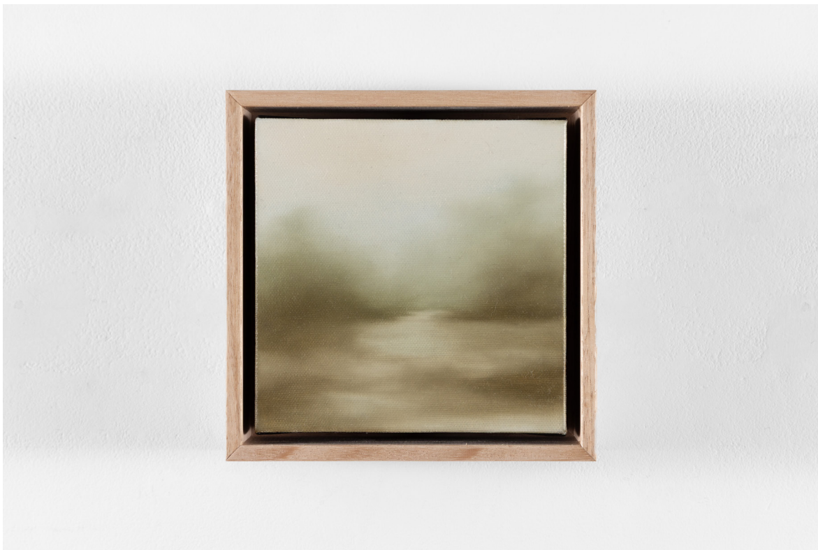
Suspended light oil on canvas natural oak frame 18 x 18 cm $750