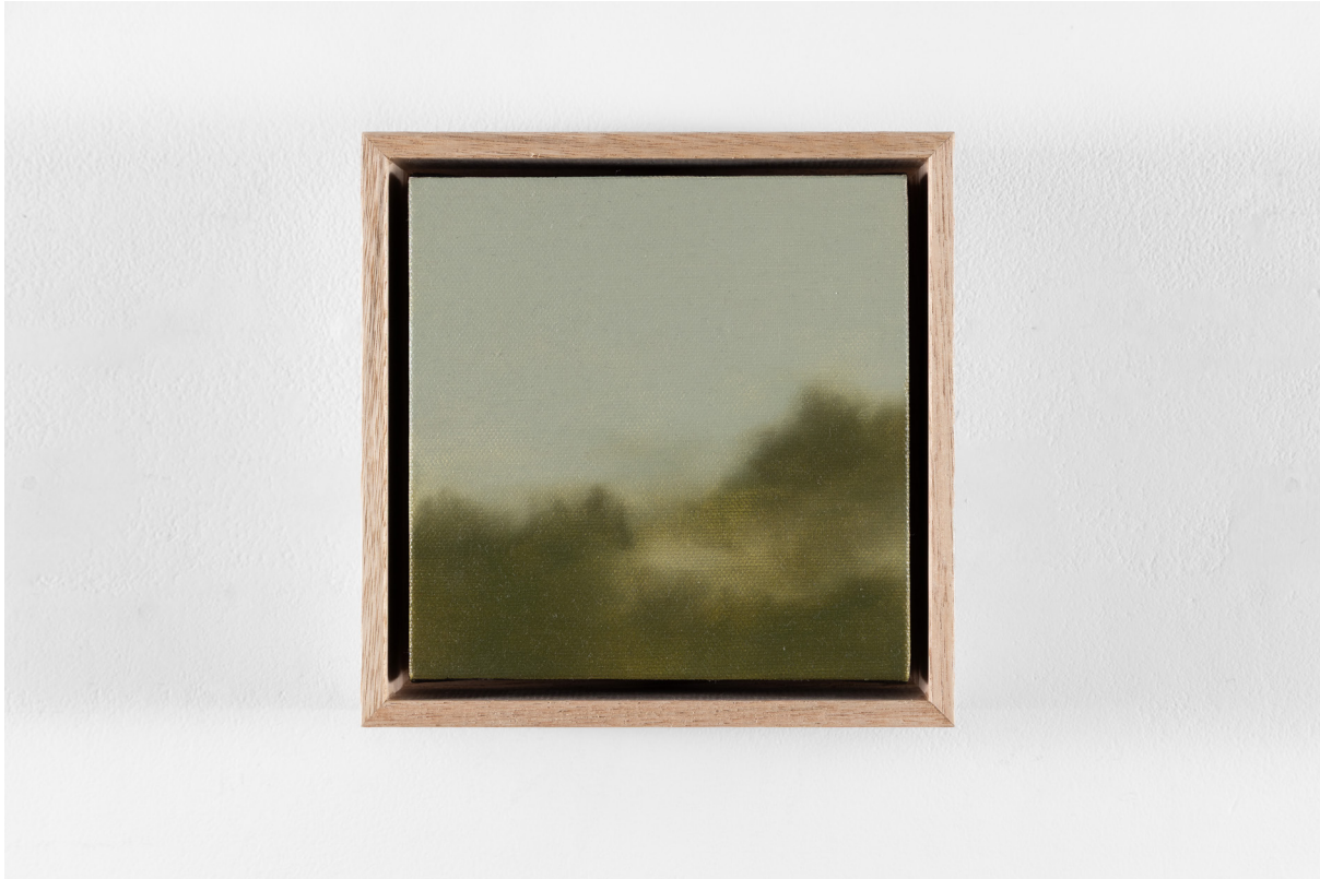
After the distance oil on canvas natural oak frame 18 x 18 cm $750