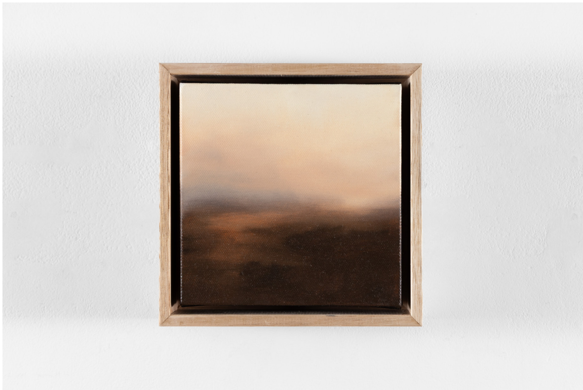
Low sky, gentle earth oil on canvas natural oak frame 18 x 18 cm $750