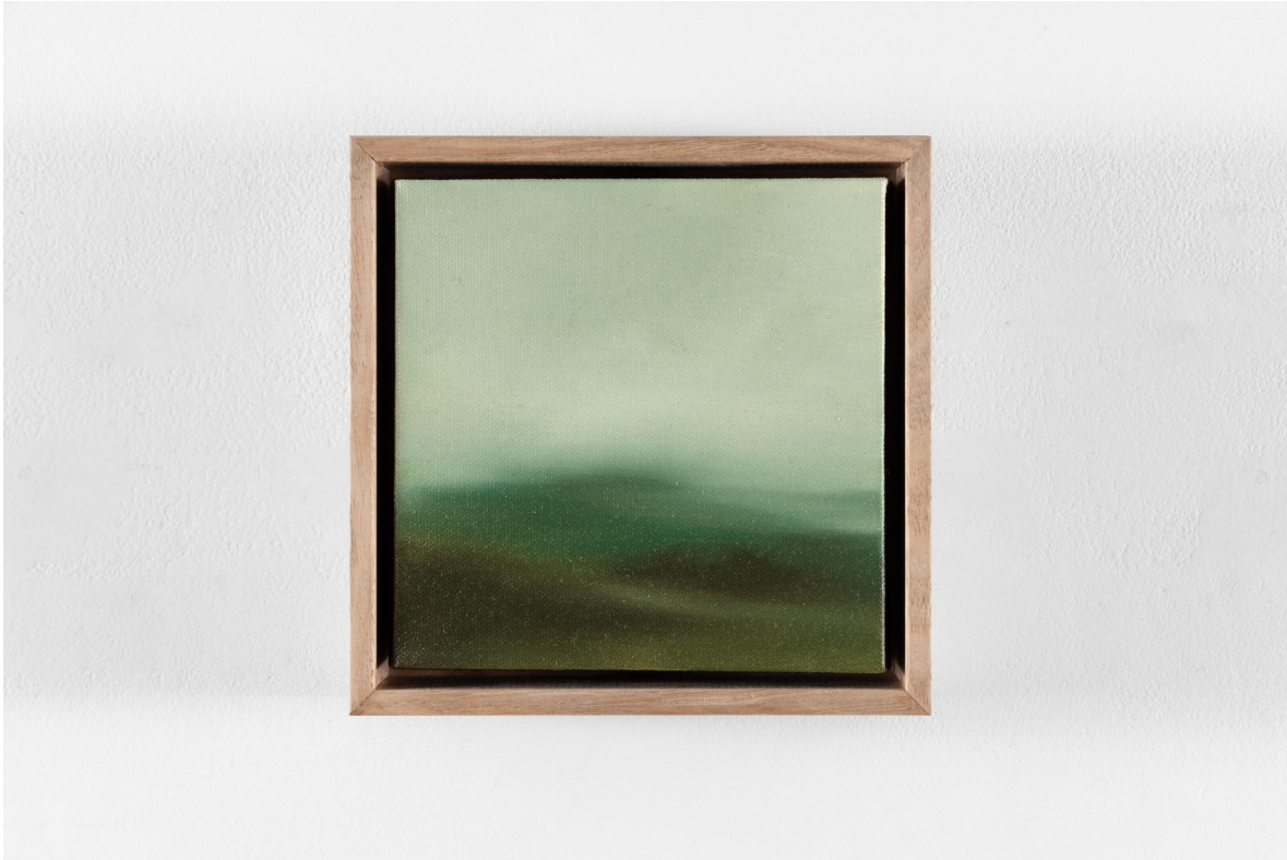
Unfolding distance oil on canvas natural oak frame 18 x 18 cm $750