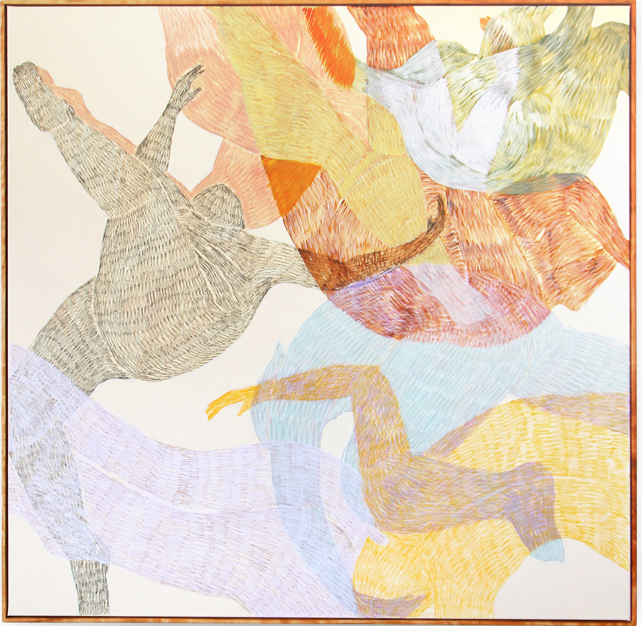
The Days In The Middle Acrylic and oil pastel on canvas Margaret River Oak frame 122.5 x 122.5 cm $6,700