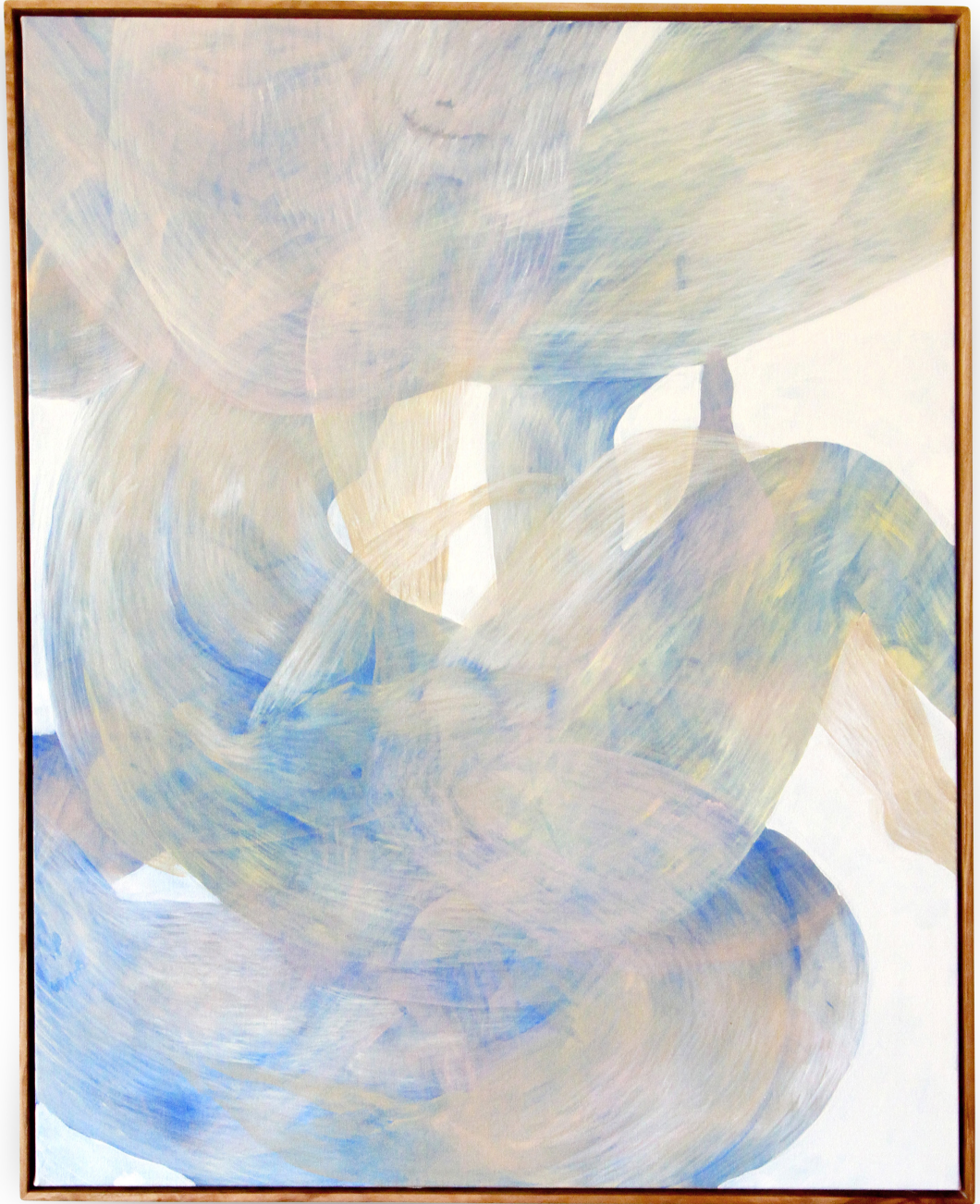
Tread Softly She's Sleeping Acrylic on canvas Margaret River Oak frame 82.5 x 102.5 cm $3,800