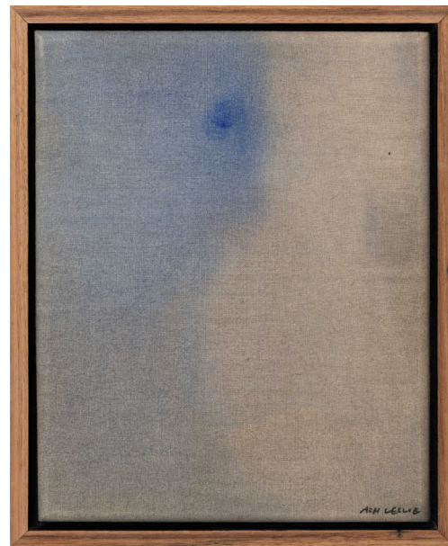
Coastline, 2025 Acrylic on raw linen Framed in Blackbutt 28 x 23 cm $740