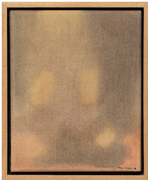
Beach Foliage, 2025 Acrylic on raw linen Framed in Blackbutt 28 x 23 cm $740