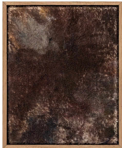
Moonlight On A Beach Towel , 2025 Acrylic on raw linen Framed in Blackbutt 28 x 23 cm $740