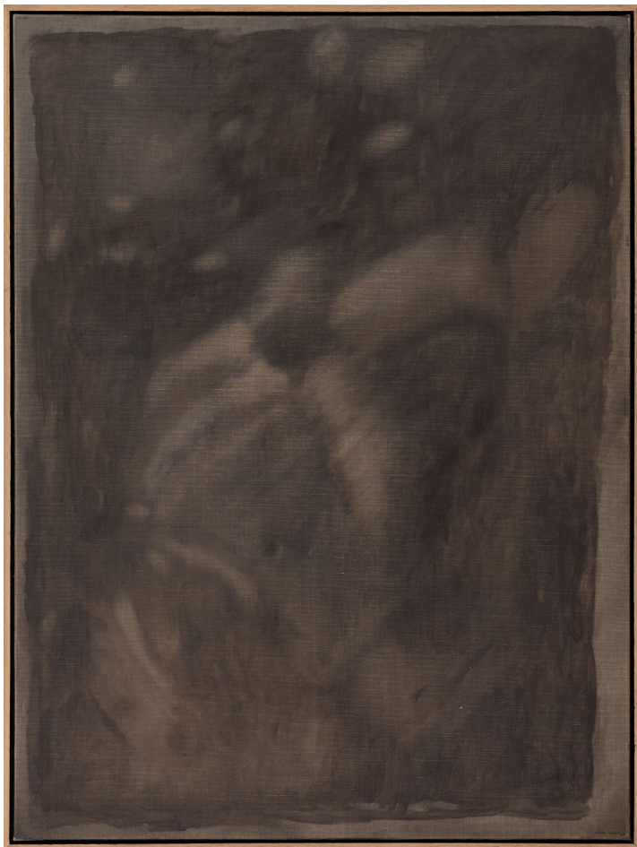
The Beach Dandelion, 2025