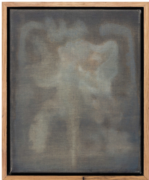
Floating Flower , 2025 Acrylic on raw linen Framed in Blackbutt 28 x 23 cm $740