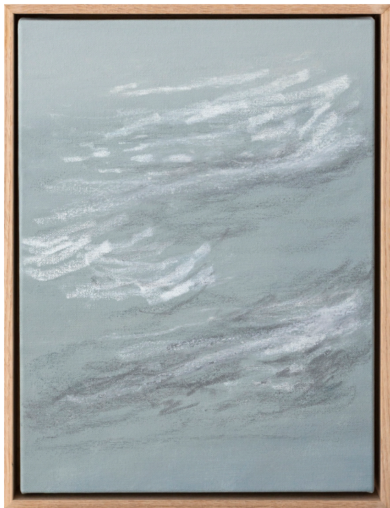
By The Creek, I Surrender, 2025 Acrylic and oil stick on cotton canvas Framed in Tasmanian oak 40 x 30 cm $850