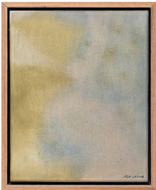
Tide Line, 2025 Acrylic on raw linen Framed in Blackbutt 28 x 23 cm $740